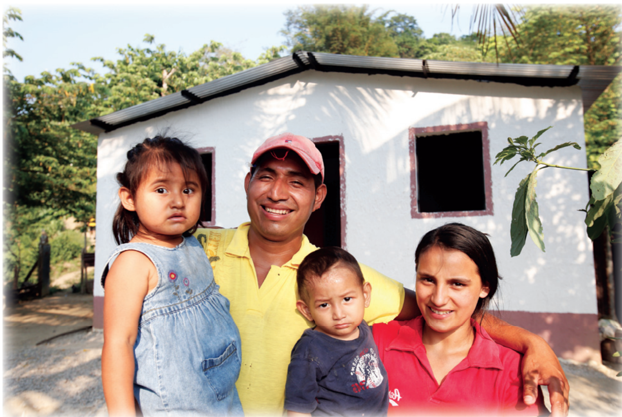
The houses being planned are similar in appearance to the one pictured above.